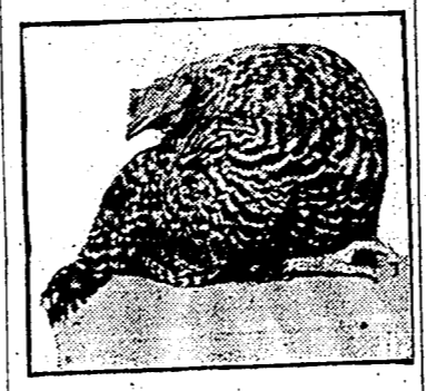
Bad Case of Wry Neck.

Limber neck in chickens is caused by ptomaine poisoning from eating decaying flesh.