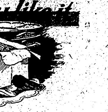
Bought in the celebrated "Triple-Seal" Brick - by the Plate or Box - in Collega Ices, Sodas and Cones -

Public is invited. This is the same meeting that originated in Ayer nearly twenty-four years ago, in 1894 and 1895, its meetings being held often in the lower town hall, until the alterations needed there made the room unsuitable.