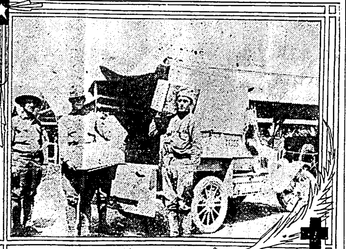
AN AMERICAN RED CROSS TRUCK BRINGING CASES OF TOBACCO FOR OUR SOLDIERS AT THE FRONT.